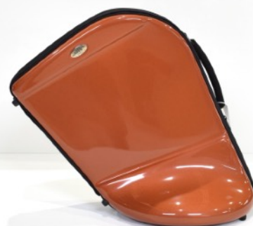
COBRE - COPPER CUIVRE - KUPFER