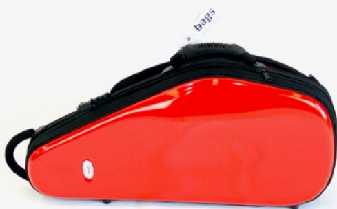
ROJO - RED - ROUGE - ROT