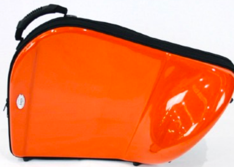
NARANJA - ORANGE