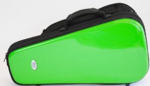
VERDE - GREEN VERT - GRÜN