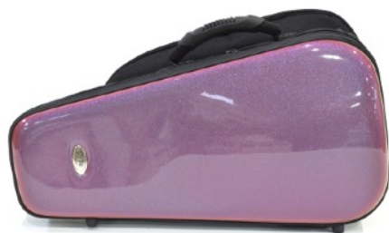
FUCSIA - FUCHSIA

All our Metalic and Inno cases, the front part is made in the selected color and the back part in graphite color , except for the black metalic cases , where both parts will be black metalic .