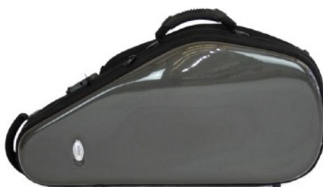
GRAFITO - GRAPHITE GRAPHIT