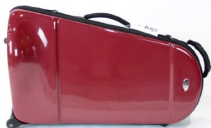
ROJO - RED - ROUGE - ROT