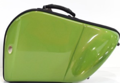
VERDE - GREEN VERT - GRÜN