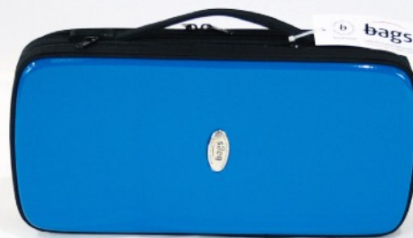
AZUL - BLUE - BLEU - BLAU