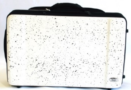
FUSIÓN BLANCO - WHITE FUSION FUSION BLANC - WEISS FUSION