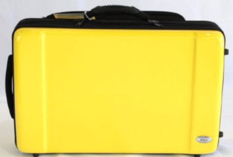
AMARILLO - YELLOW JAUNE - GELB