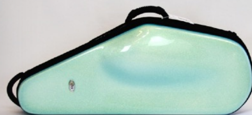
AZUL/VERDE - BLUE/GREEN BLEU/VERT - BLAU/GRÜN