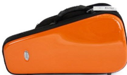
NARANJA - ORANGE