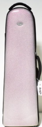
ROSA - PINK - ROSE