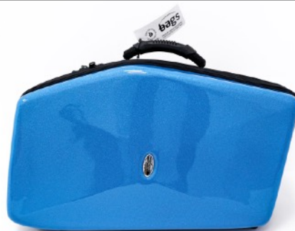
AZUL - BLUE BLEU - BLAU