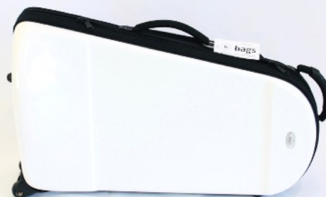
BLANCO - WHITE BLANC - WEISS