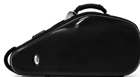
NEGRO - BLACK NOIR - SCHWARZ