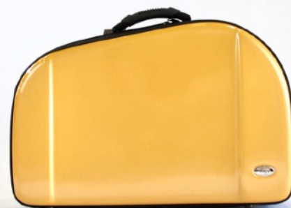
ORO - GOLD - OR - GOLD