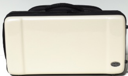
BLANCO - WHITE BLANC - WEISS