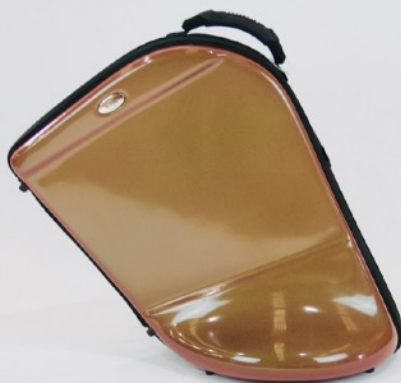
TABACO - TOBACCO TABAC - TABAK