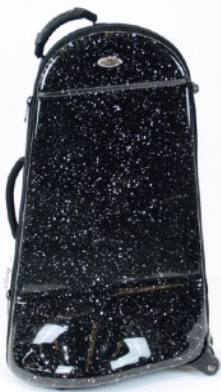
FUSIÓN NEGRO - BLACK FUSION FUSION NOIR - SCHWARZ FUSION